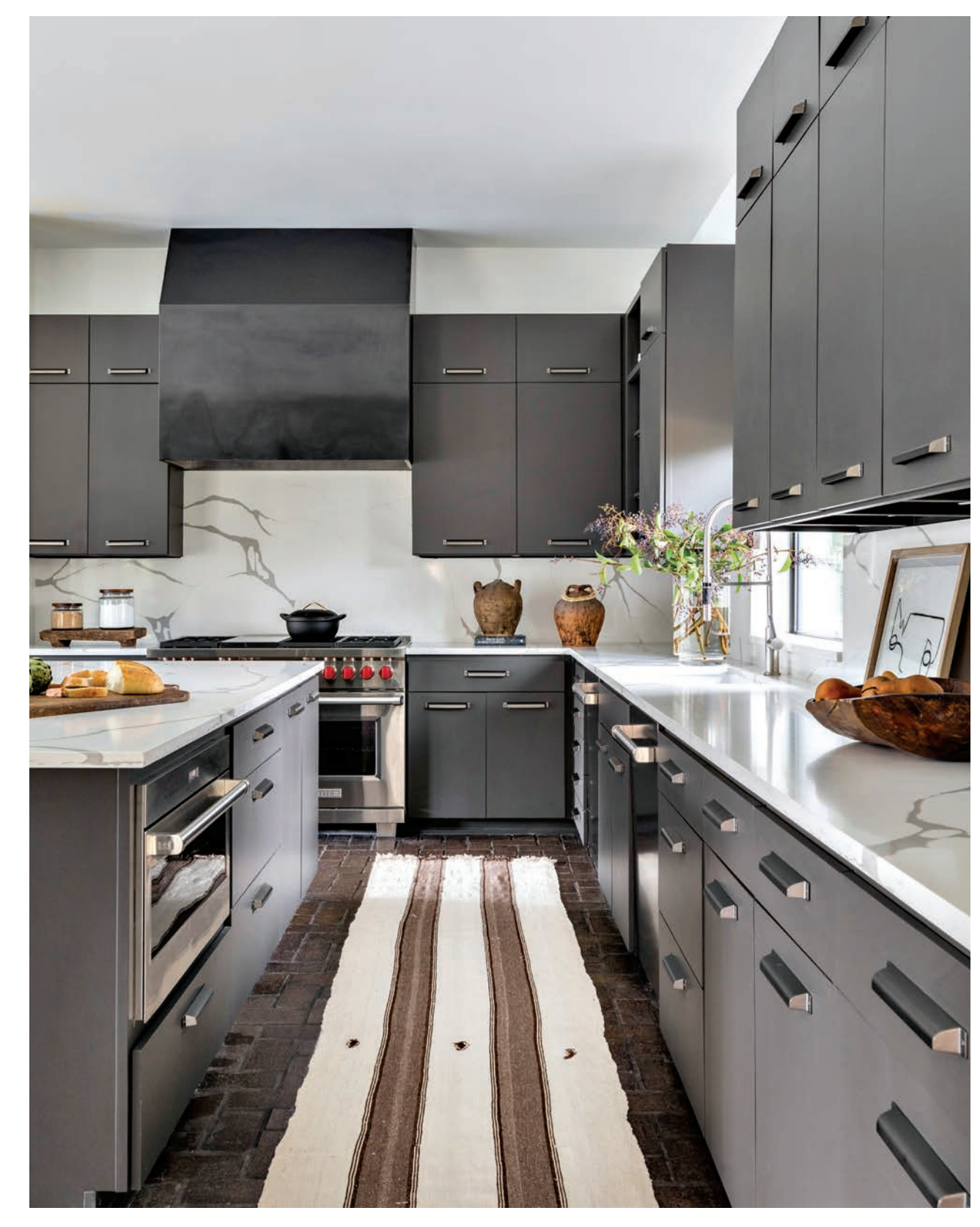
Above: In the sleek and understated kitchen, a custom metal hood by James Dawson Design, Inc. melds seamlessly with cabinetry painted Sherwin-Williams' Urbane Bronze and topped with light-colored quartz from Arizona Tile for contrast. The Wolf range is from Expressions Home Gallery.